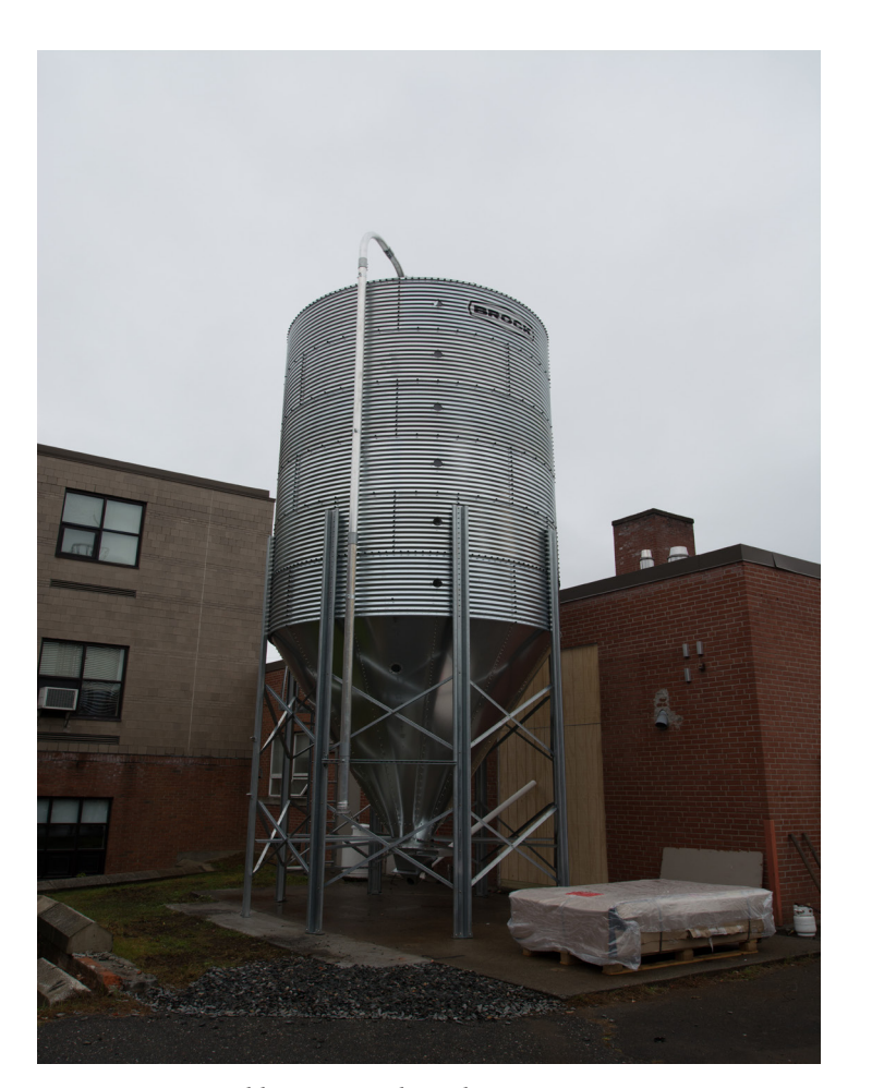
32 Ton Pellet Fuel Silo